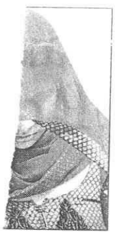
Mercury remained temperature was